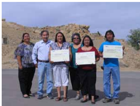
2012 HEEF IMAGINE Grant Recipients

Applications for the IMAGINE Grants can be found at www.hopieducationfund.org or by calling the HEEF staff at (928) 734-2275.