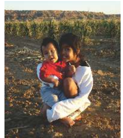
Planting a small seed can make an impact for generations.

Name:----- Address:----- City:----- State & Zip:----- Email Address:-----