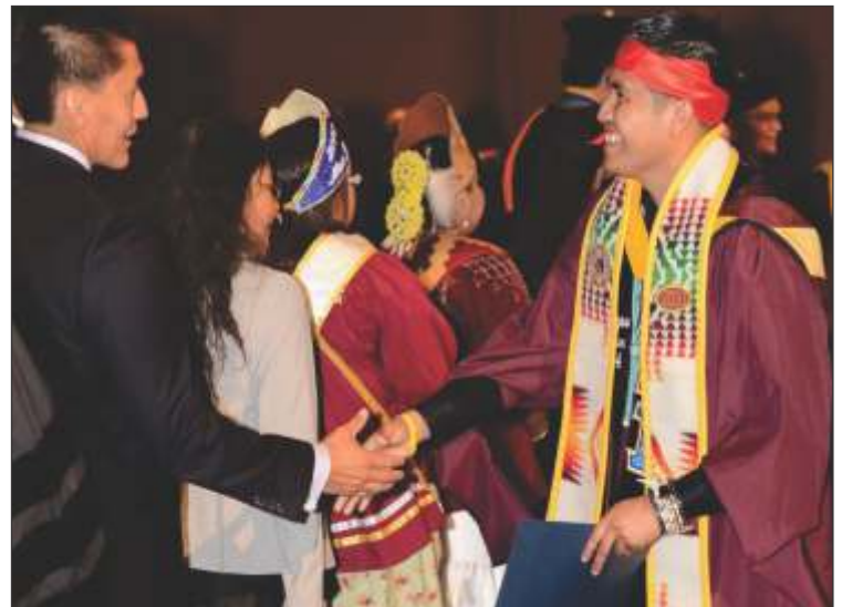
Justin happily holds his diploma and shakes the hand of AZ Senator Carlyle Begaye.

What is your personal Motto: If you come to a point in your life where you feel like giving up, you are on the right path because nothing of value comes easy.